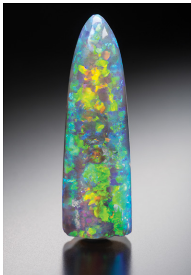
Figure 3. Belemnite, replaced by the mineraloid opal, preserves former remnants of life. Early Cretaceous: 135 Ma. From Coober Pedy, South Australia. © Jeff Scovil photo. Rob Seilecki specimen. Used with permission.

To geoscientists, the value of minerals to science is broadly recognized. Resulting from complex planetary processes, minerals are extraordinary archives of Earth’s mysteries, allowing scientists to decipher ~4.5 billion years of embedded history. For example, the minerals in a pallasite meteorite contain clues to the composition, formation conditions, and evolution of the early Solar System, with implications for core-mantle development of Earth. Glacial ice, a mineral, shapes continents, modulates Earth’s surface temperatures, and moderates climate variations; it also traps gas bubbles that sample prehistoric CO 2 and CH 4 levels. Other minerals, such as calcite, can record in their oscillatory zoning patterns the thermal, chemical, and mechanical interactions in complex geosystems. Portions of the biosphere, such as pollen grains, invertebrate exoskeletons, and vertebrate bones and teeth are (bio)minerals. Their former presence, now as fossilized remnants of past life, owe their persistence to mineral replacement (Fig. 3).