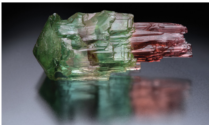
Figure 1. Elbaite crystal, a species of the tourmaline supergroup containing lithium, showing its noncentrosymmetric growth along the long axes (c) which is responsible for its piezoelectric (and pyroelectric) properties, contributing to its utility as a technological material. Color change reflects incorporation of different chemical elements in response to its host environment.

The attributes of minerals to science, technology, and society are illustrated by a single mineral, elbaite. Elbaite is a species of the tourmaline supergroup that incorporates nearly the entire periodic table in its structure (Fig. 1). For geoscientists, it embeds unparalleled geologic information when properly interpreted; for technology, it was utilized during WWII as a pressure sensor to monitor underwater explosions due to its piezoelectric properties; and for society, it is a mineral that contains lithium, an element critical to powering modern electronic devices.