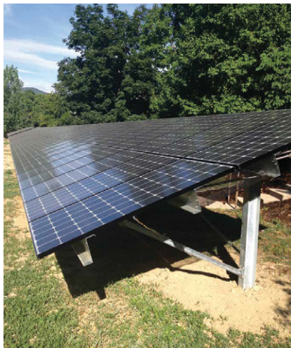
Figure 6. Panel of solar photovoltaic cells at the GSA Headquarters in Boulder, Colorado, USA; used with permission. Perovskite photovoltaics potentially replace the more common silica-based solar cells and have a higher efficiency.

chemical substituents; it can be engineered to incorporate REEs, making this material extremely useful as a functional material. Their ability to be fabricated in thin films makes perovskites ideal for solar photovoltaic cells (Fig. 6). Perovskite photovoltaics are an emerging technology due to their high efficiencies for converting sunlight to energy. Recent advances to scaling up production of these high-efficiency perovskite solar cell modules have introduced organics into the perovskite precursor—allowing a uniform thin film to be deposited across the entire photovoltaic module area (Huang et al., 2021).