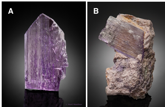
Figure 5. Spodumene, a primary source of lithium. (A) Specimen 28 × 15.6 × 2.2 cm. Big Kahuna II zone, Oceanview Mine, Pala District, San Diego County, California, USA. Oceanview Mines, LLC, specimen (20120615–01); (B) spodumene in the rock.