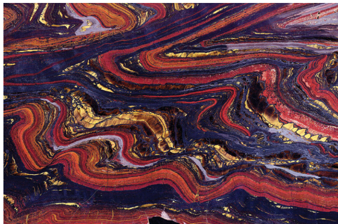
Figure 2. Banded iron formation, a source for iron, a critical component of steel and other manufactured materials. Iron was one of the earliest mined and smelted minerals.