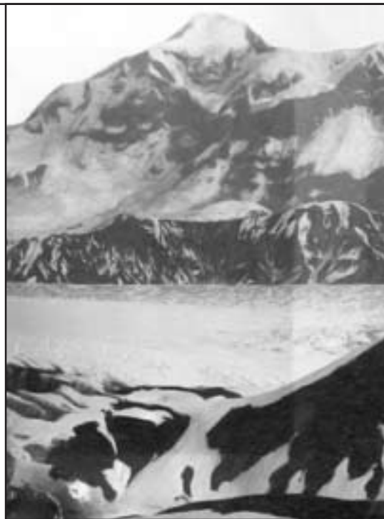
Mount St. Elias from Agassiz Glacier, Yakutat district, Alaska Gulf region, ca. 1892 (photo by Russell, courtesy U.S. Geological Survey photo archives).

Due to delays and the characteristic inclement weather of the St. Elias Range, Russell never did achieve the