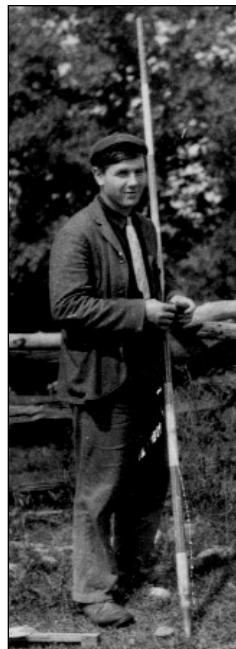
Norman L. Bowen on his first job involving land surveying.

He was first attracted to Norway because of J. H. L. Vogt's (1903–1904) book, Die Silikatschmelzlösungen and by W. C. Brøgger, who had applied physicochemical principles developed in the investigation of slags to the problem of differentiation. Bowen was discouraged, however, from going to Norway because of the language barrier and because Brøgger was too busy with legislative duties. Instead, Bowen went to MIT to study under the sparkling and charismatic teacher Reginald A. Daly, who indoctrinated him with the idea that basaltic liquid was a primary magma and all others were derivative.