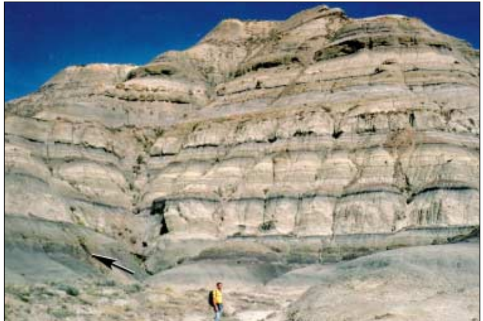
Figure 1. The K-T boundary (arrow) in the sequence of paleosols in Bug Creek (NW¼NW¼SE¼, sec. 17, T. 22 N., R. 43 E.), McCone County, Montana. The iridium anomaly is weak here because of bioturbation into a moderately developed paleosol beneath the dark gray band exposed in the trench excavated low in the bluffs to the left.