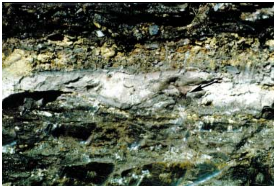
Figure 2. The K-T boundary and impact beds near Brownie Butte (SE \frac{1}{4} SW \frac{1}{4} SW \frac{1}{4} , sec. 32, T. 21 N., R. 37 E., Garfield County), Montana. The branching and upward-forked brown carbonized material in the pink boundary bed (arrow) is a frayed shoot, as predicted by the model of Alvarez et al. (1995), not a root, as interpreted by Fastovsky et al. (1989).

A dramatically different view emerges from calculations based on the impact and boundary beds at Brownie Butte, for which a maximal acid consumption of 986 \text{ keq/ha} can be calculated by using parent material with the composition of tektites from Beloc, Haiti (Table 1). By the model of Alvarez et al. (1995), this amount of acid would have been consumed within hours; by the model of Fastovsky et al. (1989), it would have been consumed within a year. This more serious acid load is compatible with prior theoretical estimates of acid production. Estimates on the production of \text{NO}_2 by a bolide capable of creating K-T geochemical anomalies have varied from 1 \times 10^{14} to 1.2 \times 10^{17} moles (Lewis et al., 1982; Prinn