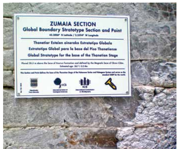
Figure 2. Plaque that marks the Global Standard Stratotype Section and Point (GSSP) for the base of the Thanetian Stage (Paleocene Series, Paleogene System) at Zumaia, the Basque Region, Spain.

Since the first GSSP was ratified in 1972 for the boundary between the Silurian and Devonian systems, 62 of the 100 boundary levels that define the stages, series, and systems of the ICS Chart (download from www.stratigraphy.org ) have ratified GSSPs. Most often, these sites are marked with an explanatory panel, a formal plaque (Fig. 2), and a “golden spike” (Fig. 3).