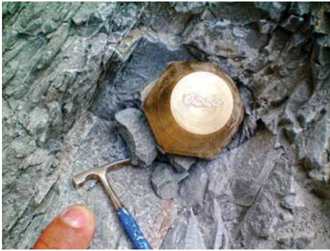
Figure 3. Top of golden spike emplaced in bed that is the Global Standard Stratotype Section and Point (GSSP) for the Thanetian Stage. Length of “rock hammer” is 5 cm.