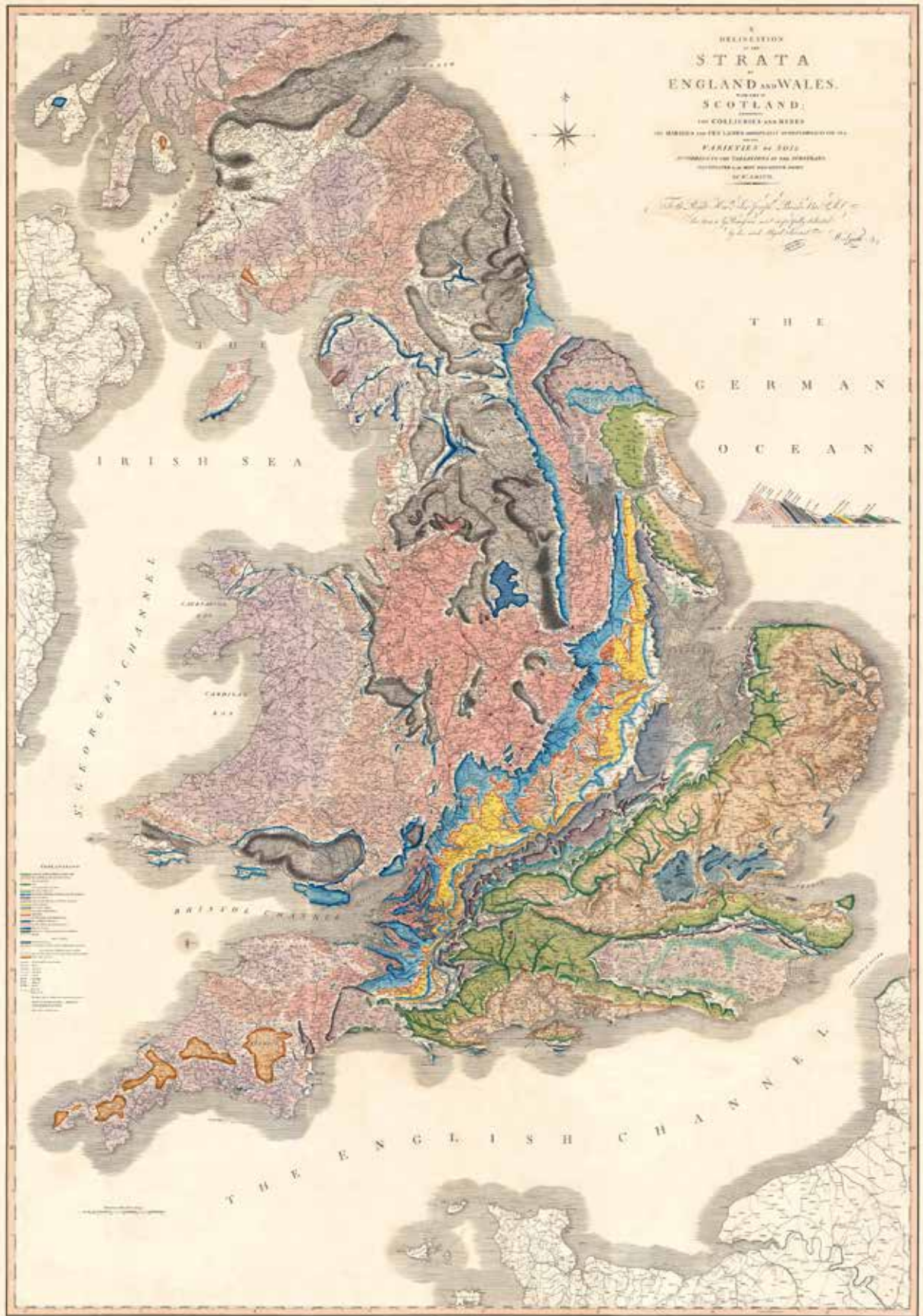
Smith's A Delineation of the Strata of England and Wales, with Part of Scotland , published in September 1815.