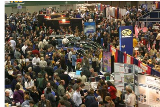
Sunday night Welcoming Party in the Exhibit Hall at Seattle during the 2003 GSA Annual Meeting.