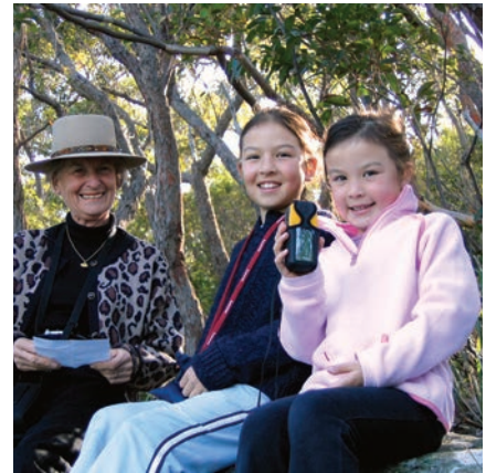
Mega-event denotes a high-profile gathering in the geocaching community: 500+ people, held annually and attracting attendees from all over the world.