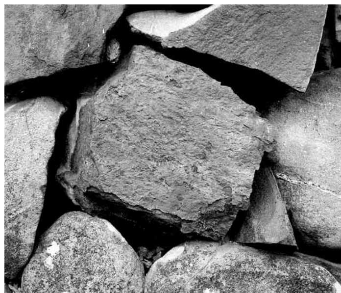
Stone wall, Farmington, CT.