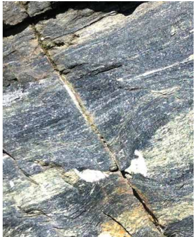
Boudins in metaigneous rocks of the Middletown Complex in the Bronson Hill terrane, Tolland, CT.