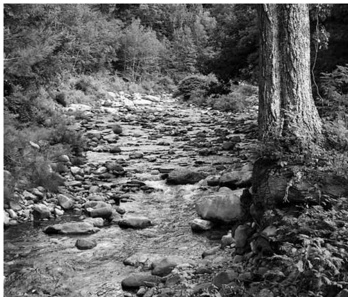
Typical New England brook in western uplands, Sherman, CT.

Share a Room/Share a Ride: Use the GSA Meetings Bulletin Board to connect with colleagues & friends, to find roommates & rides, and to arrange get-togethers. The service is free, but you must sign in to use it. Log on at http://rock.geosociety.org/forumstudenttravel/ .